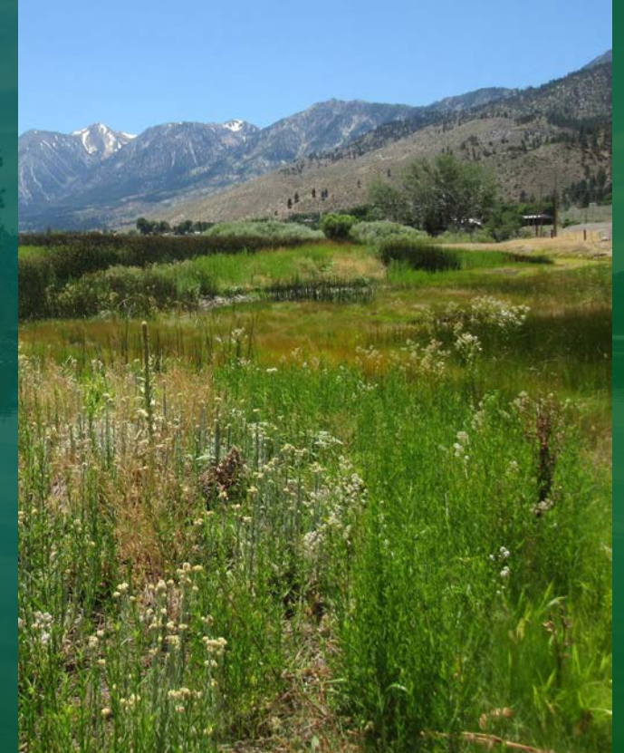
Hot springs at River Fork Ranch (B. Bushman)