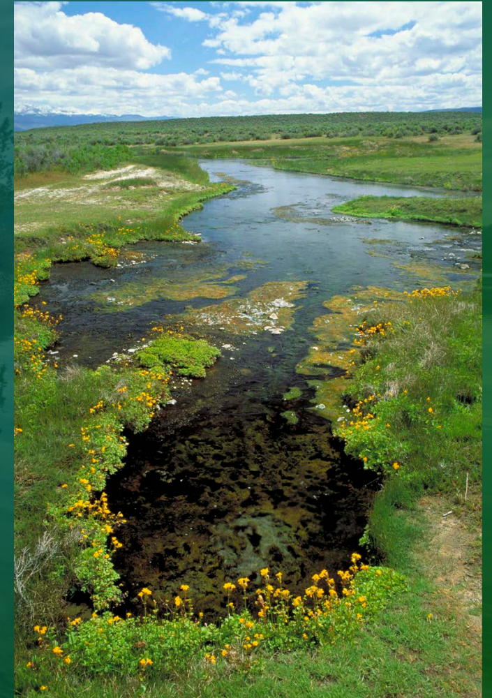
Bog Hot Springs