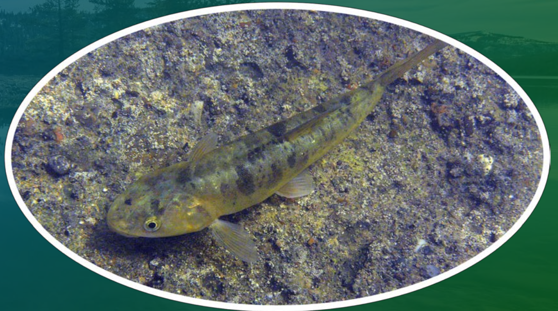
Pahranaगत roundtail chub